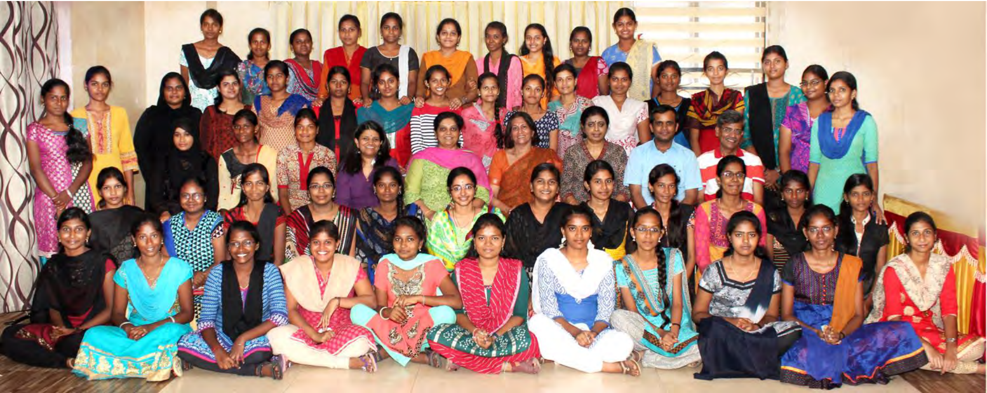
The Pudumaipenn family - 2017