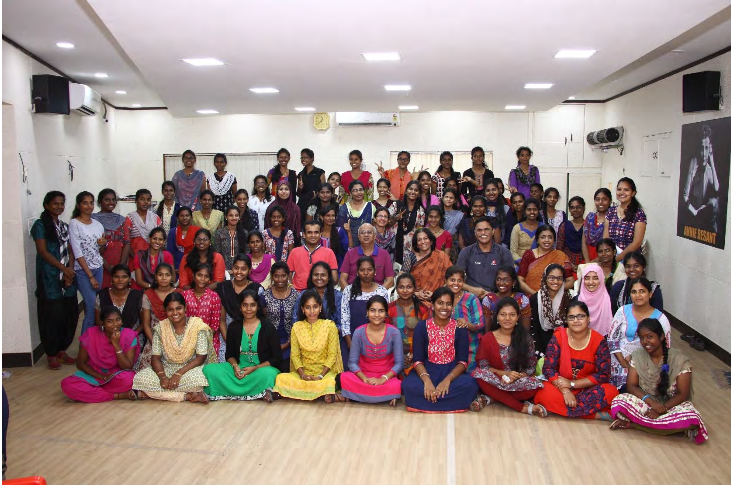
The Pudumaipenn family - 2019