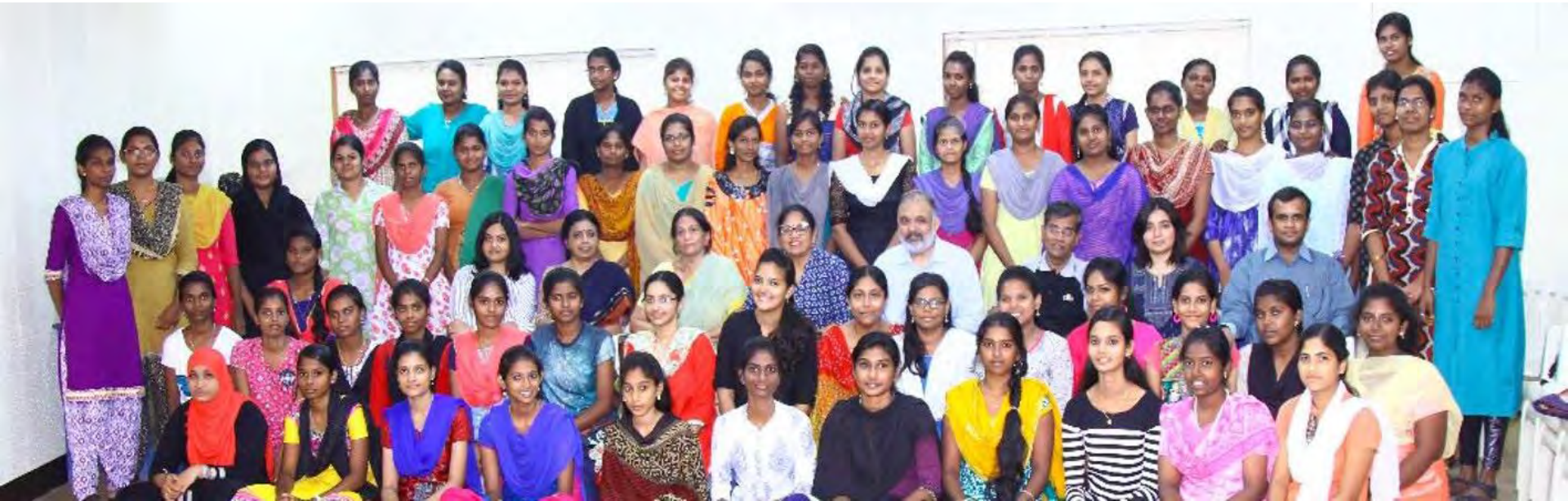
The Pudumaipenn family - 2018