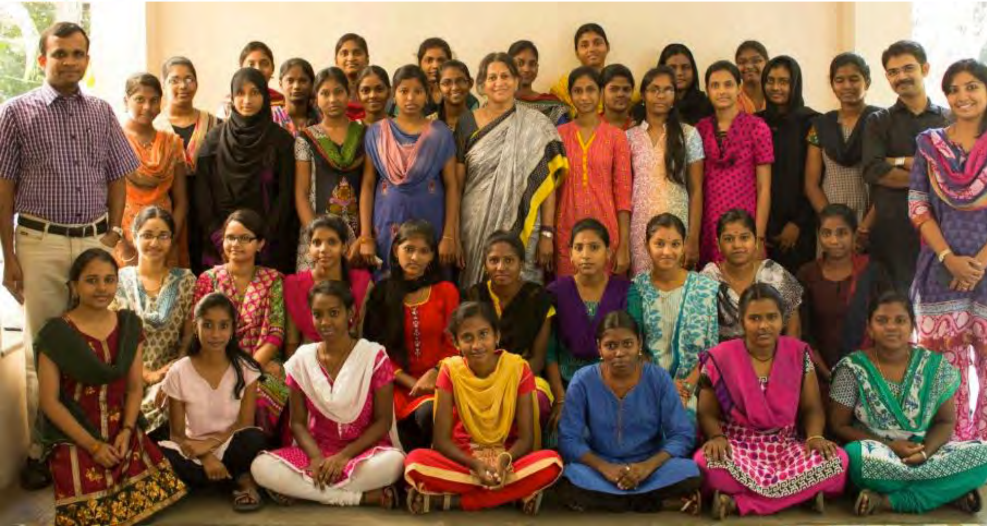
The Pudumaipenn family - 2016