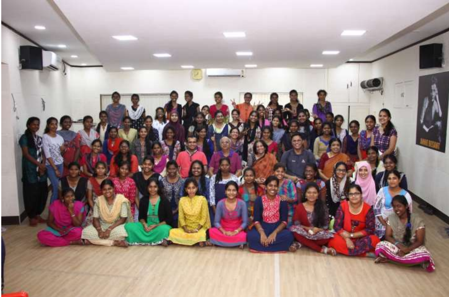
The Pudumaipenn family - 2019