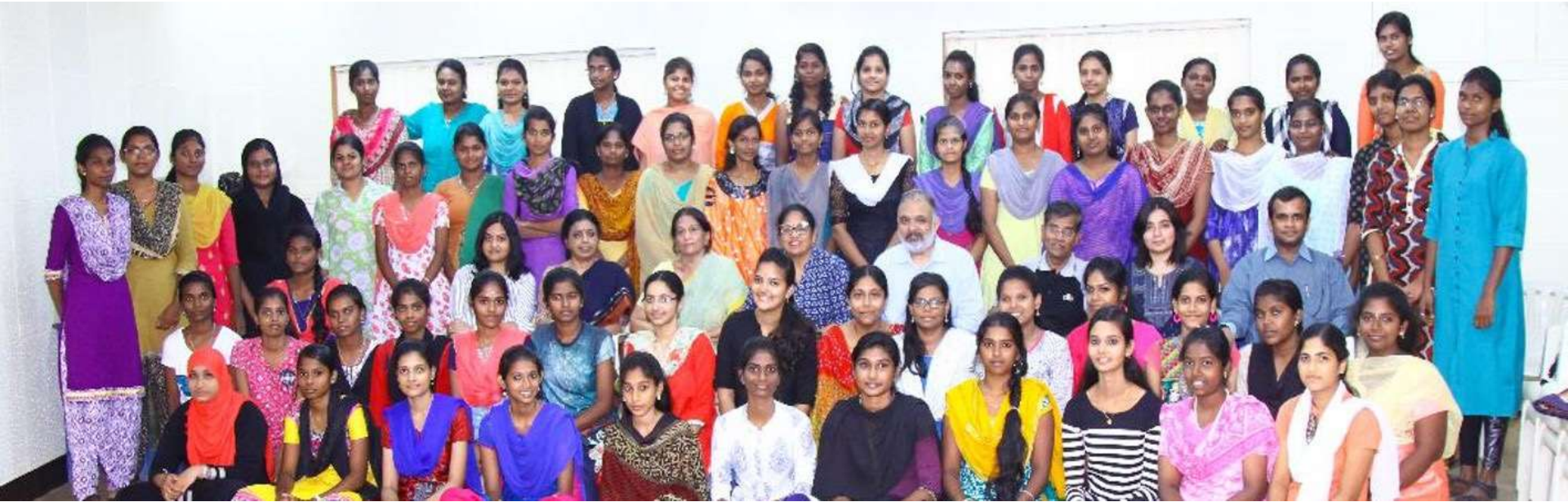
The Pudumaipenn family - 2018